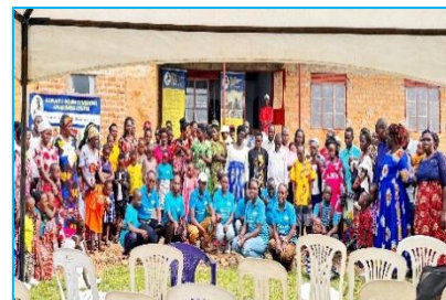
Our members Celebrating the Christmas Basket

RDSAC's development has been a huge voluntary effort, using support from whoever and wherever possible.