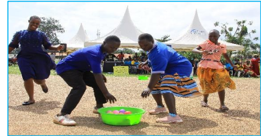
Our members engaging in Play activities during the Awareness Month Celebrations