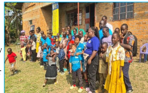
Members at the Annual Christmas Basket Party - 2024

"a problem shared is a problem halved..."