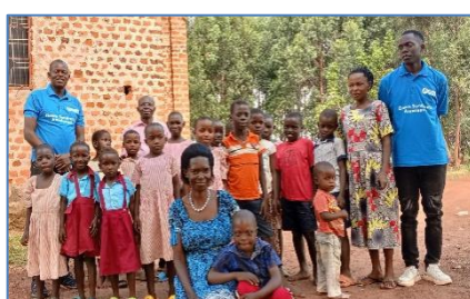
Advocating for Inclusivity in Schools - Kigorobyia Town Council