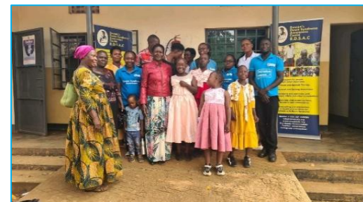
Masindi Support Group after their Group and financial management training