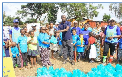
DFCU Bank sharing packages with our members