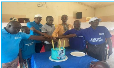
the DHO, DCDO and members of RDSAC cutting the cake at the WSDS 24 celebrations in Masindi District