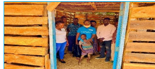
Visiting the Poultry Project of our members in Kigorobya