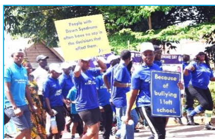
Marching during the WSDS Celebrations In Masindi