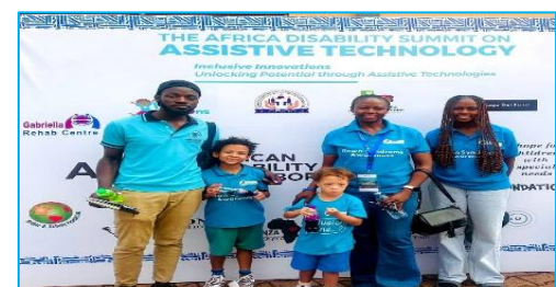
Attending the Africa Disability Summit on Assistive Technology